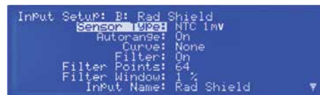
Intuitive menu structure Logical navigation allows you to spend more time on research and less time on setup.