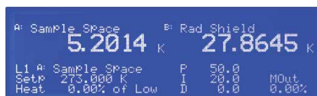
Two input/output display with labels Reading locations can be user configured to meet application needs. Here, the input name is shown above each measurement reading along with the designated input letter.