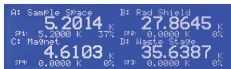
Four input/output display with labels Standard display option featuring all four inputs and associated outputs.

The Model 350 offers a bright, graphic liquid crystal display with an LED backlight that simultaneously displays up to eight readings. You can show all four loops, all inputs, or if you need to monitor one input, you can display just that one in greater detail. Or you can custom configure each display location to suit your experiment. Data from any input can be assigned to any of the locations, and your choice of temperature or sensor units can be displayed. For added convenience, you can also custom label each sensor input, eliminating the guesswork in remembering or determining the location to which a sensor input is associated.