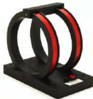
FH-6 Helmholtz Coil