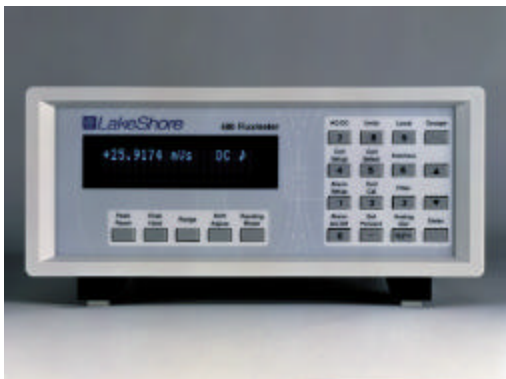
Model 480 Fluxmeter

When used with a Helmholtz coil, a fluxmeter provides a value for the magnetic moment of a test sample when the magnet is placed between the coils in alignment with the coil axis and rotated 180 degrees or withdrawn. The Model 480 easily accommodates magnetic moment measurement with single sample extraction, double extraction with sample rotation, or rotation of the sample within the coil. Reliable measurement is more a function of consistent adherence to a documented test procedure and operator comfort with the measurement method than selecting a superior test method. Record this value for use in subsequent calculations. The fluxmeter and Helmholtz coil can also be used with a non-magnetic sample fixture to ensure consistent testing of samples in series.