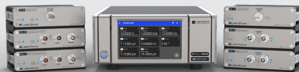
M81-SSM synchronous source measure system

This modular, multichannel system provides highly synchronized DC, 100 kHz AC, and mixed DC + AC sourcing and measuring — including both voltage and current lock-in measurement capabilities — for low-temperature material research performed in your cryostat. It supports up to three remote-mountable source and three measure modules per a single M81-SSM-6 instrument and, owing to its modularity, allows signal and source amplifiers to be located as close as possible to the sample being characterized. This minimizes the signal wiring to the sample, reduces noise, and increases measurement sensitivity. The modules also leverage patent-pending MeasureSync™ real-time sampling technology to ensure synchronous sourcing and measuring across all channels. Plus, by having both DC and AC sourcing and measurement in one instrument, the M81-SSM can eliminate the need for mixed-instrument setups, greatly simplifying the setup of complex characterization configurations.