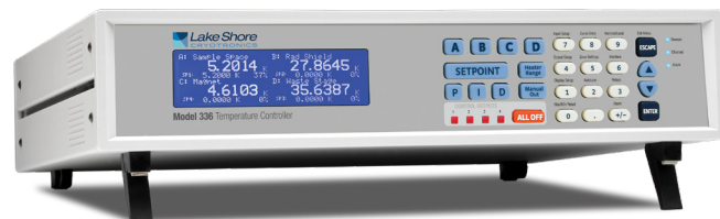
336 temperature controller