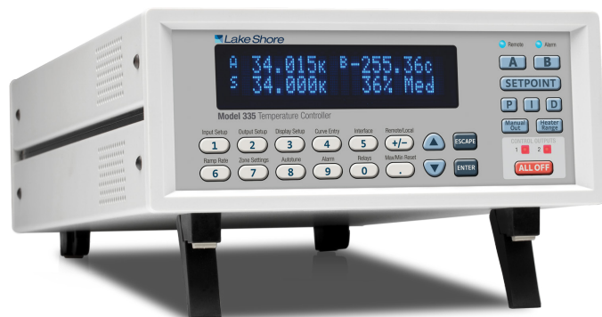
335 temperature controller