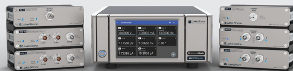
M81-SSM synchronous source measure system

This modular, multichannel system provides highly synchronized DC, 100 kHz AC, and mixed DC + AC sourcing and measuring — including both voltage and current lock-in measurement capabilities — for low-temperature material research performed in your cryostat. It supports up to three remote-mountable source and three measure modules per a single M81-SSM-6 instrument and, owing to its modularity, allows signal and source amplifiers to be located as close as possible to the sample being characterized. This minimizes the signal wiring to the sample, reduces noise, and increases measurement sensitivity. The modules also leverage patent-pending MeasureSync™ real-time sampling technology to ensure synchronous sourcing and measuring across all channels. Plus, by having both DC and AC sourcing and measurement in one instrument, the M81-SSM can eliminate the need for mixed-instrument setups, greatly simplifying the setup of complex characterization configurations.