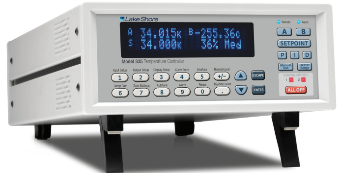
335 temperature controller