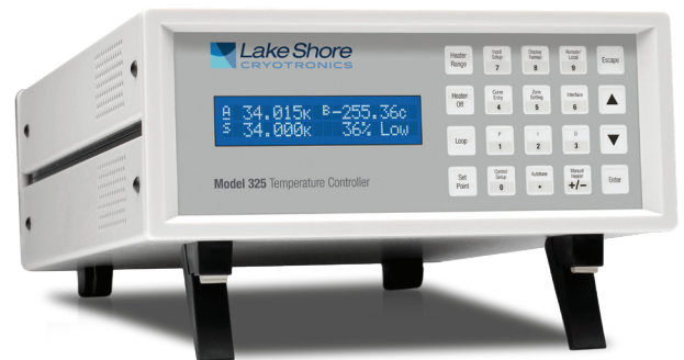
325 temperature controller