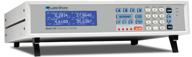
336 temperature controller

Temperature controller 336 , 335 , or 325