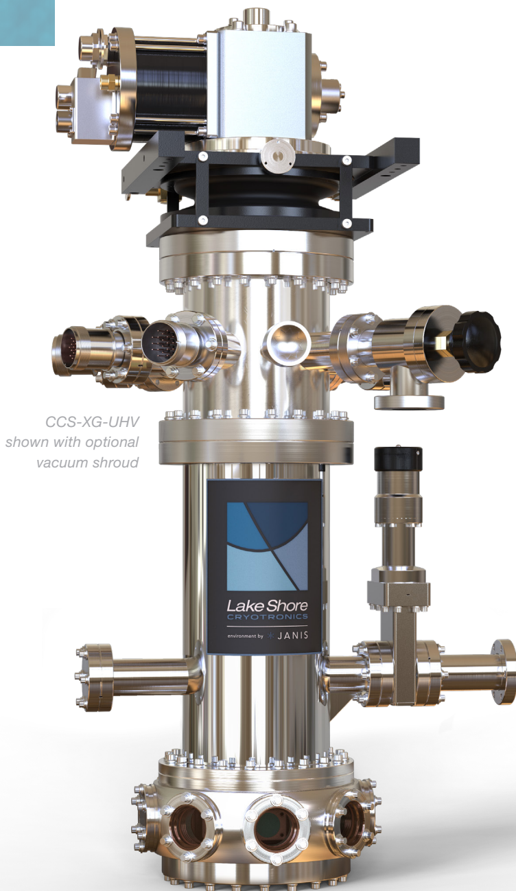
CCS-XG-UHV shown with optional vacuum shroud

Integrated control heater and calibrated control sensor