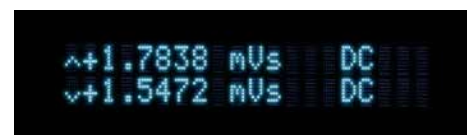
DC positive and negative peak on—the display shows both the positive and negative DC peak readings