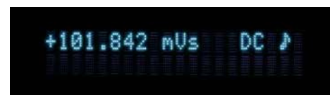
Alarm on—the alarm gives an audible and visual indication of when the flux value is selectively outside or inside a user-specified range