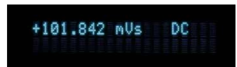
Normal reading—the default mode with the display of the live DC flux reading

Following are three examples of the various display configurations: